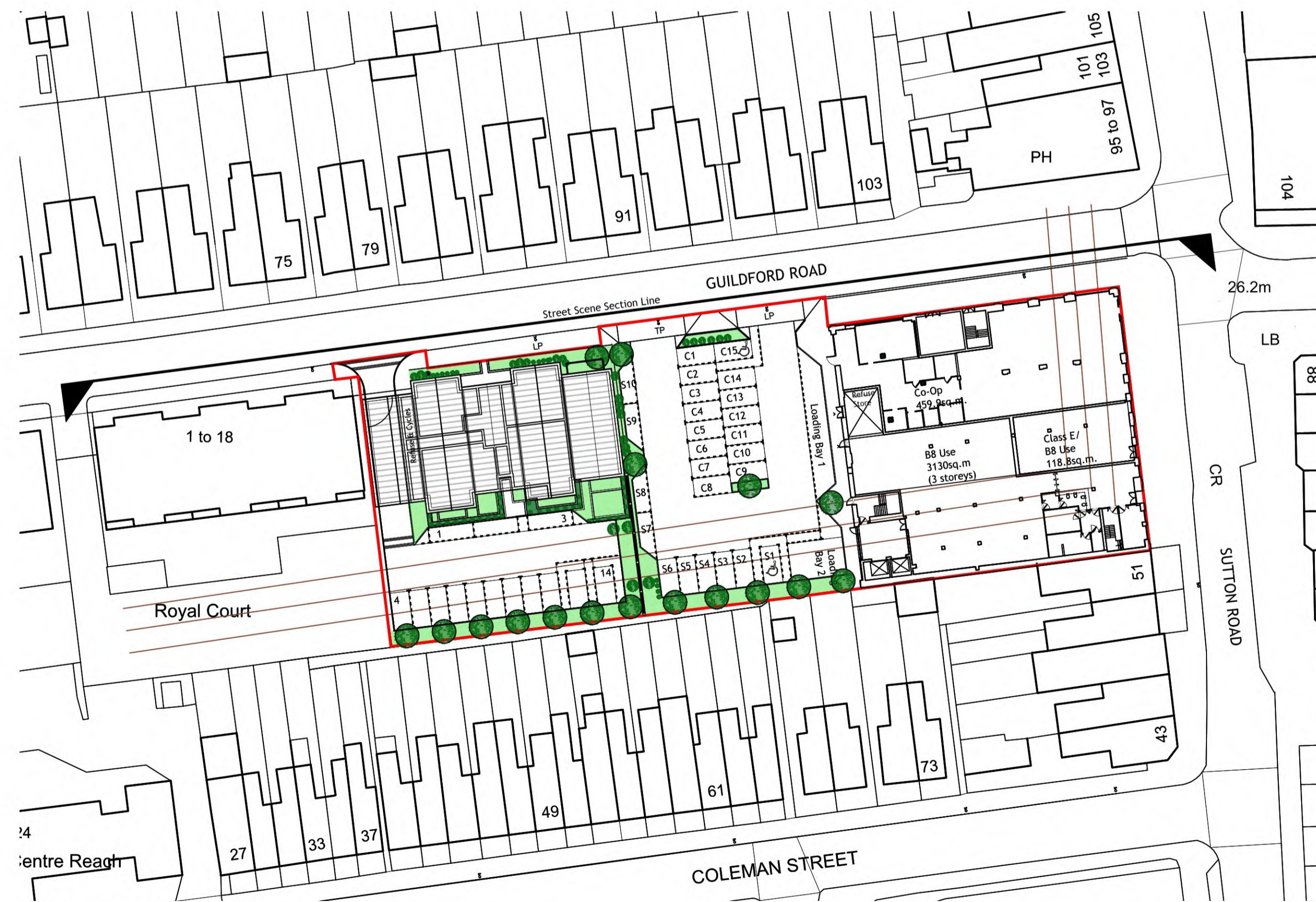
Guildford Road Street Scene Key 1:500