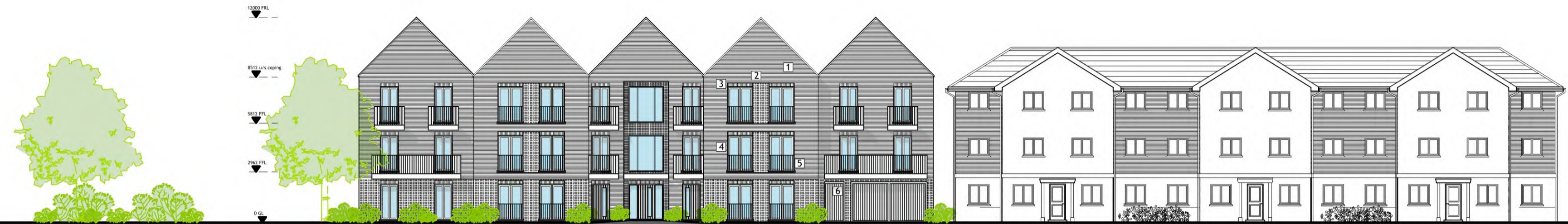
Front (North) Elevation