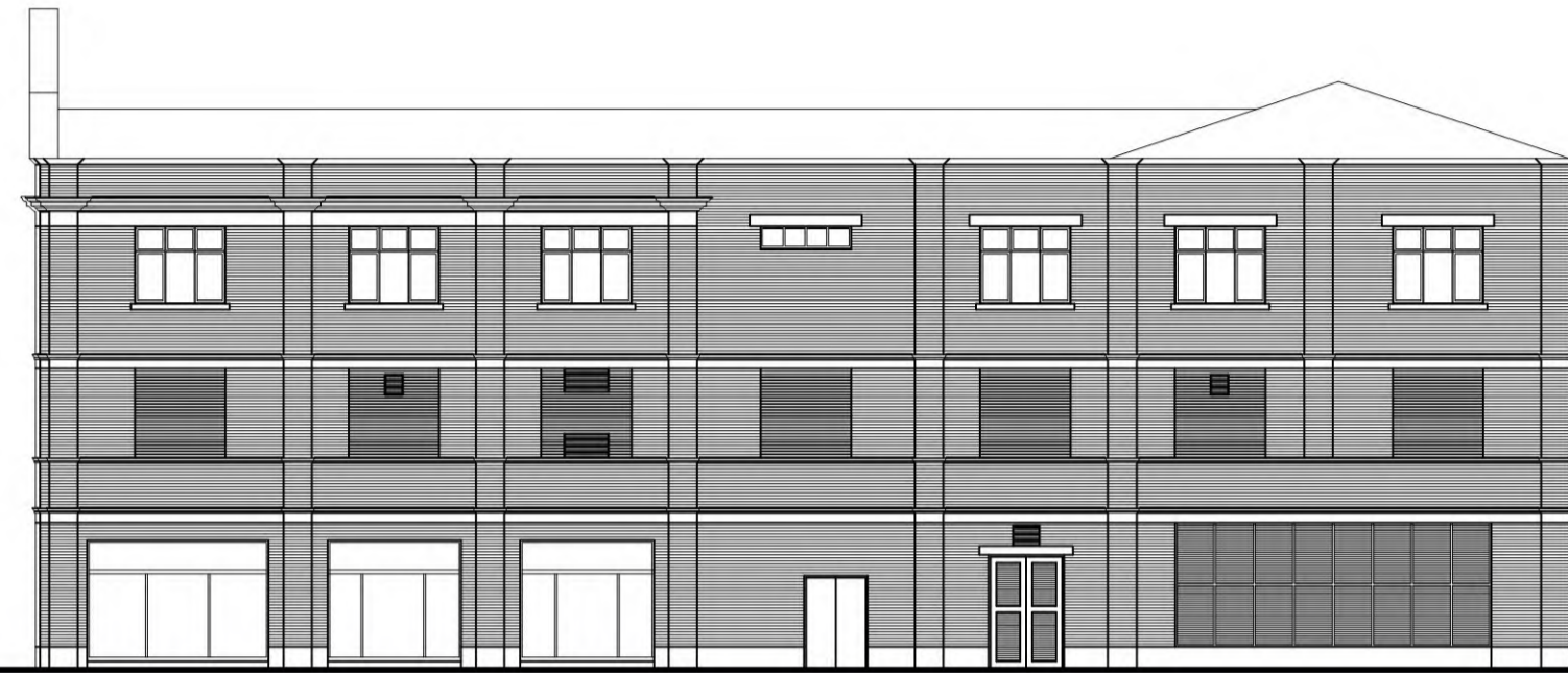
Existing Side elevation to Guildford Road