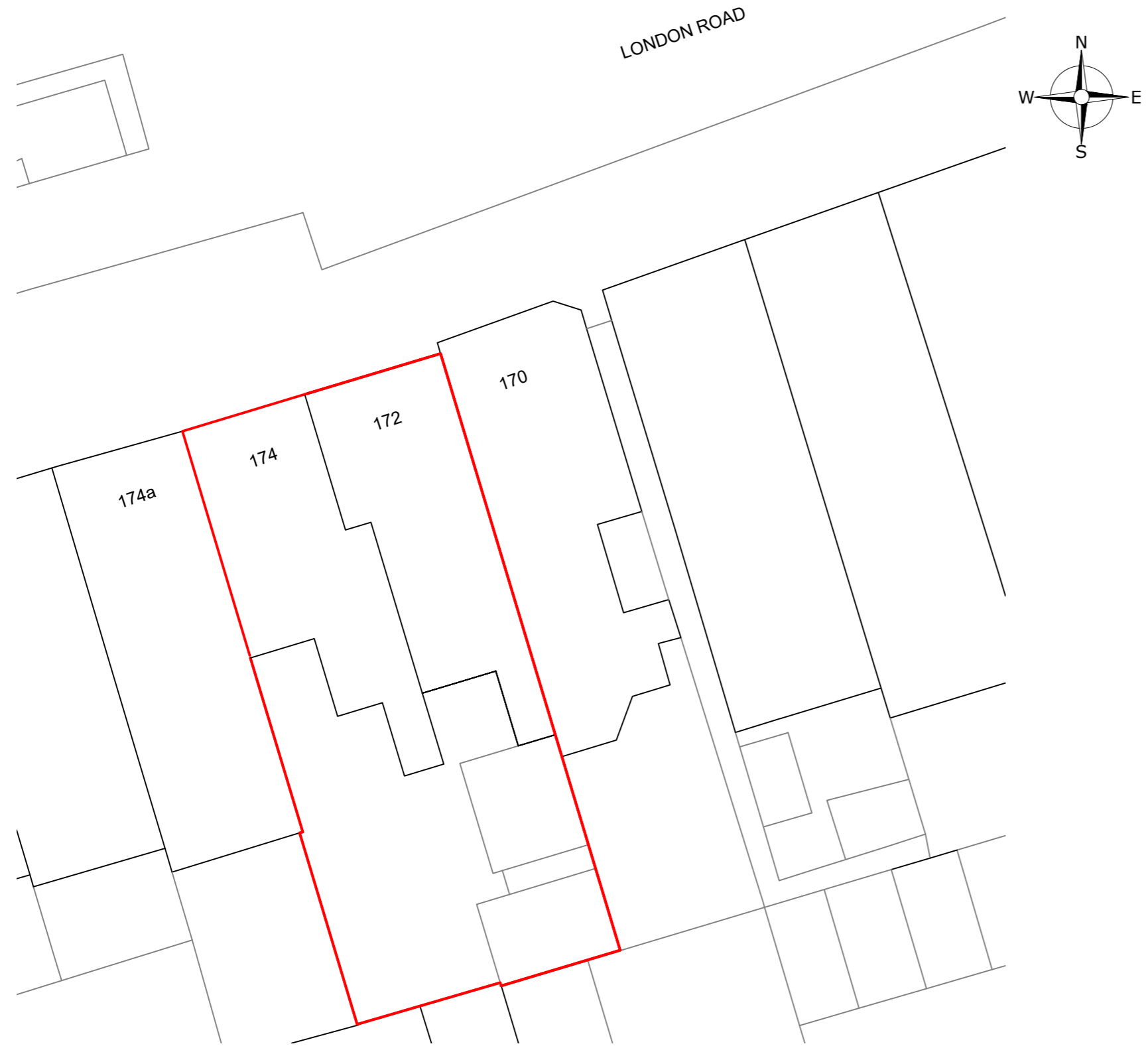
SITE PLAN SCALE 1:200 0 1 2 3 4 5m

NOTES: Do not scale this drawing. Work to figured dimensions only. Check all dimensions on site. Confirm any discrepancies prior to commencement of work.