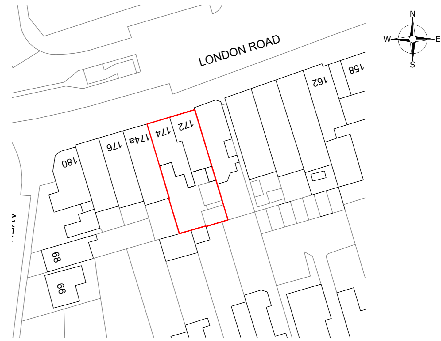
BLOCK PLAN SCALE 1:500 0 5 10 15 20m