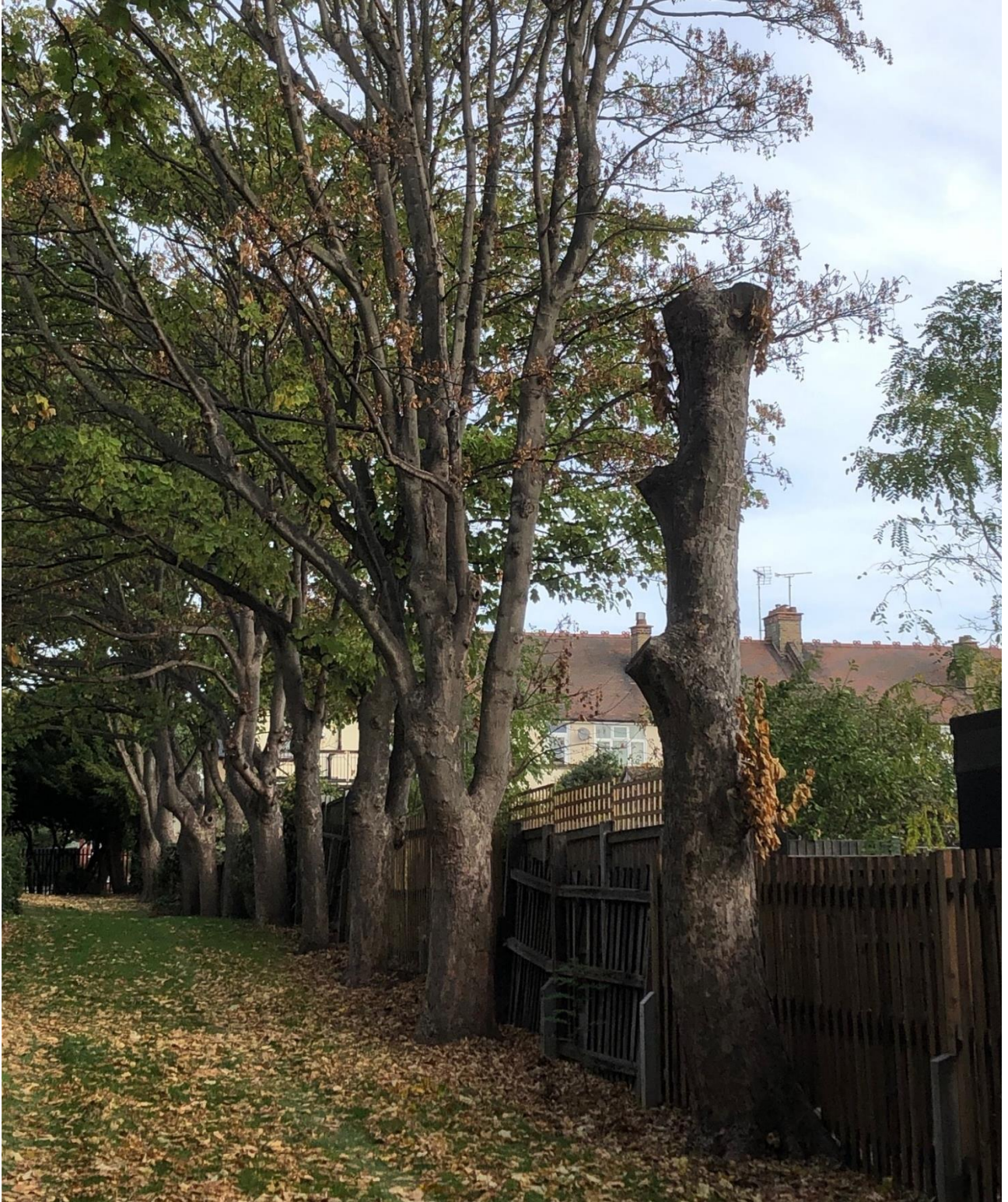
Figure 4 Impact of severe pruning works on wider group