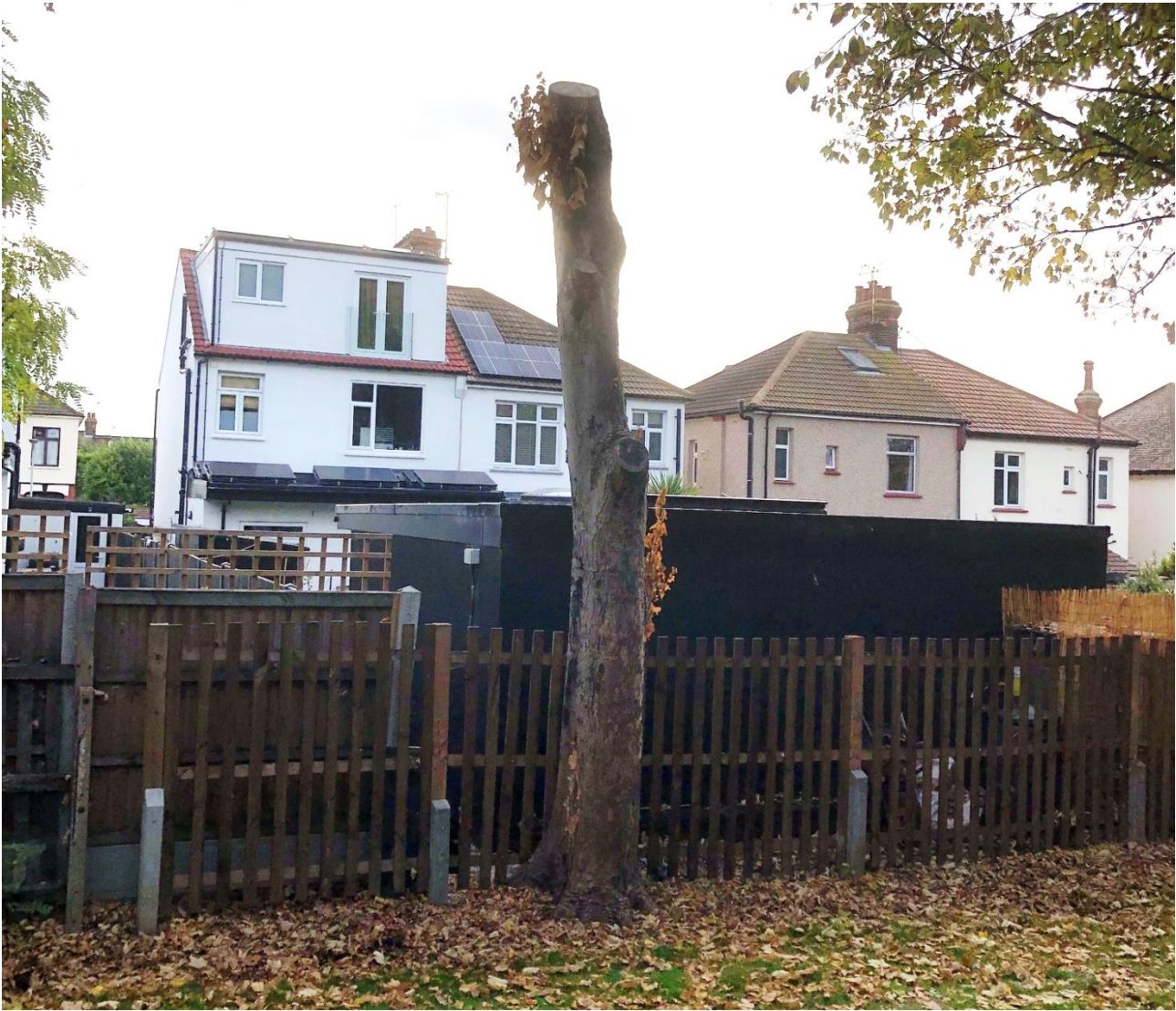
Figure 3 Severe pruning works triggering request for TPO