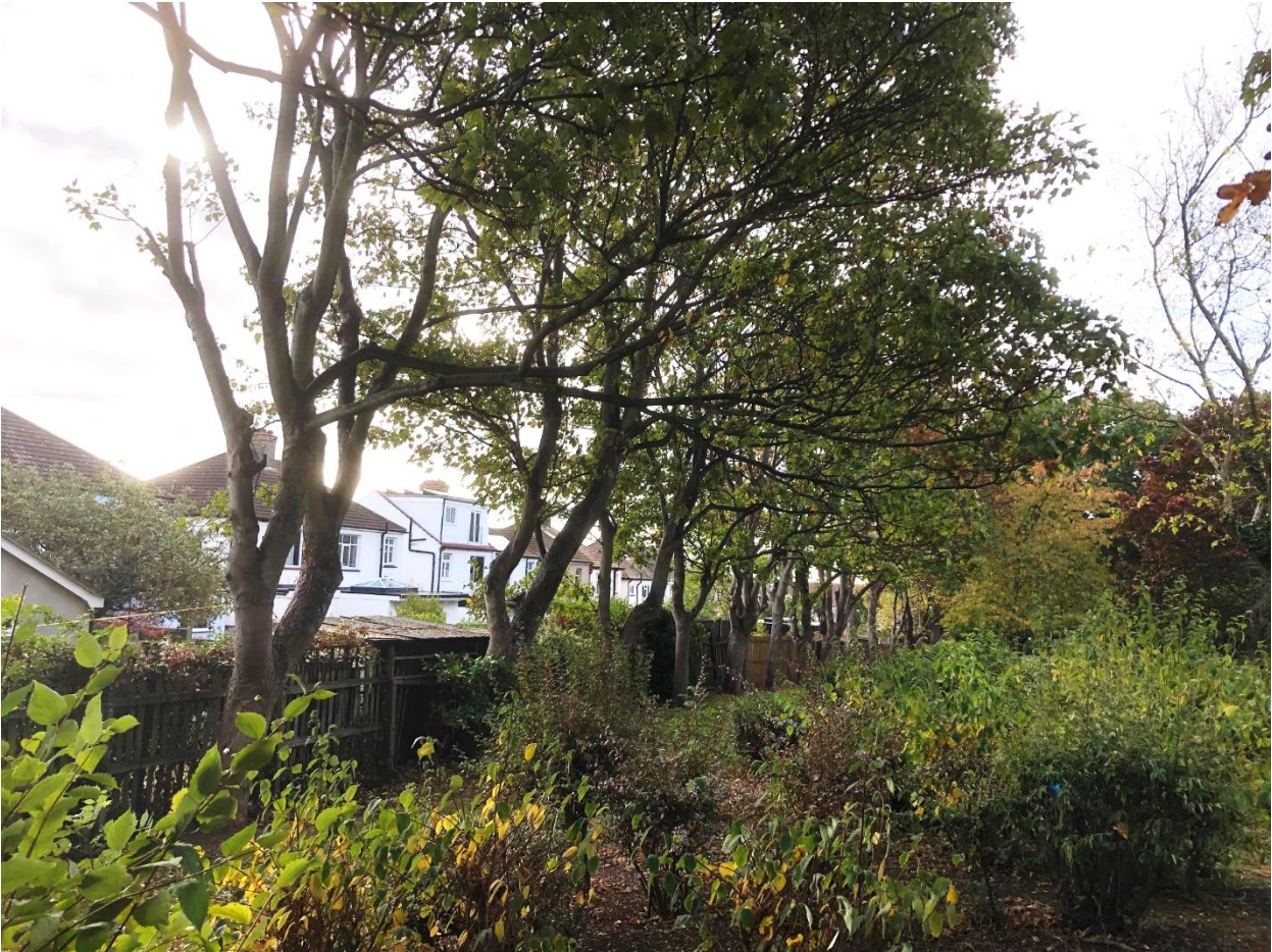
Figure 1 (above) Group looking south