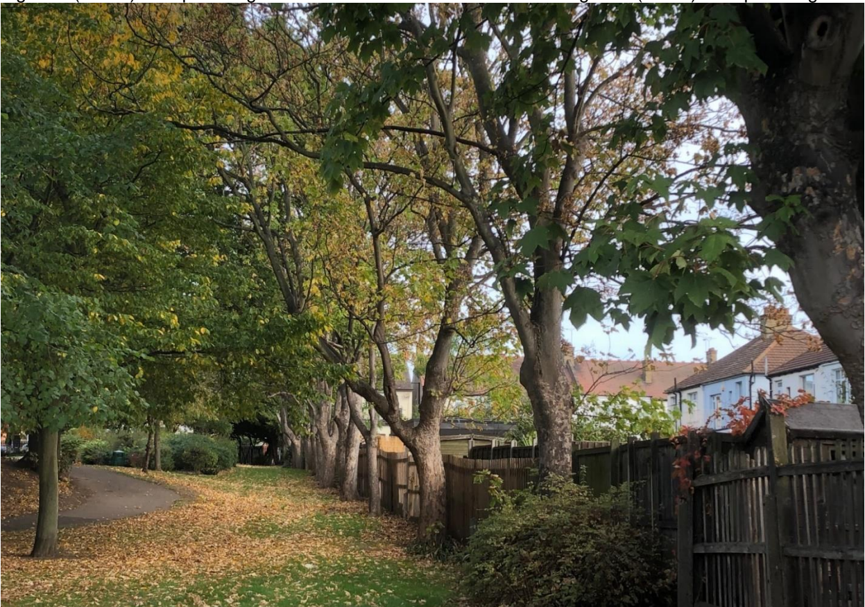
Figure 2 (below) Group looking north