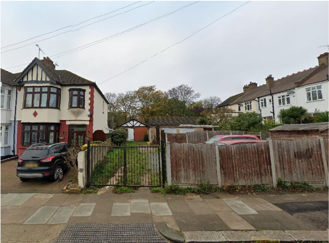
Figure 5 and 6 Views of trees from Victoria Road