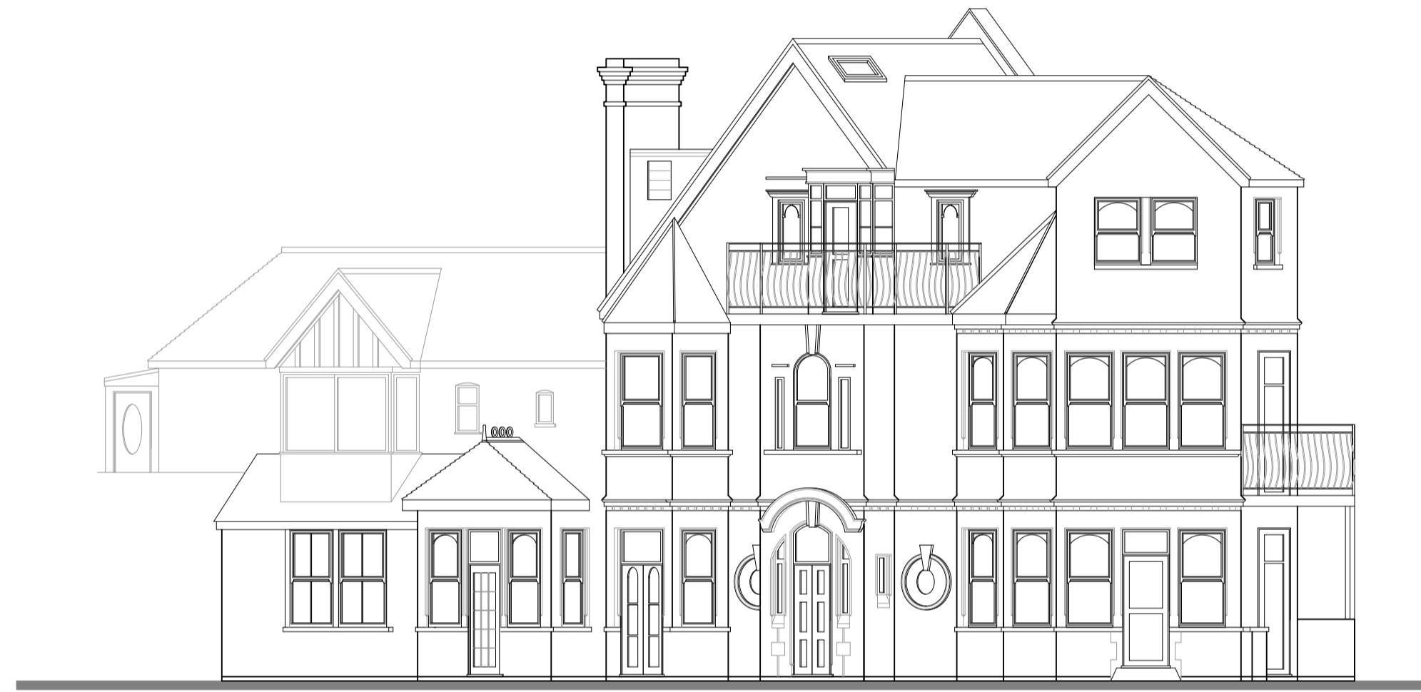
South West East