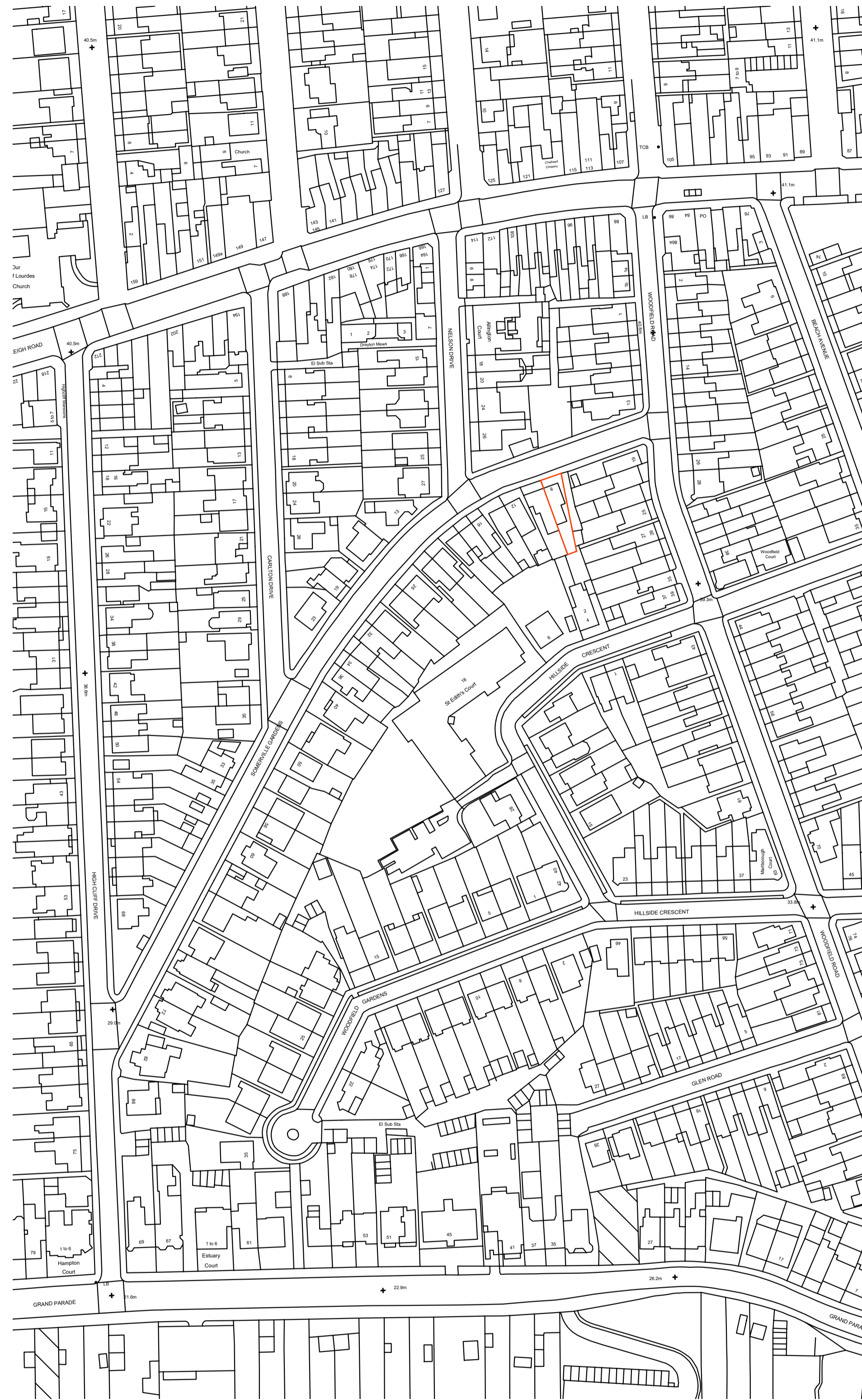
1 SITE LOCATION PLAN SCALE: 1:1250 @ A2