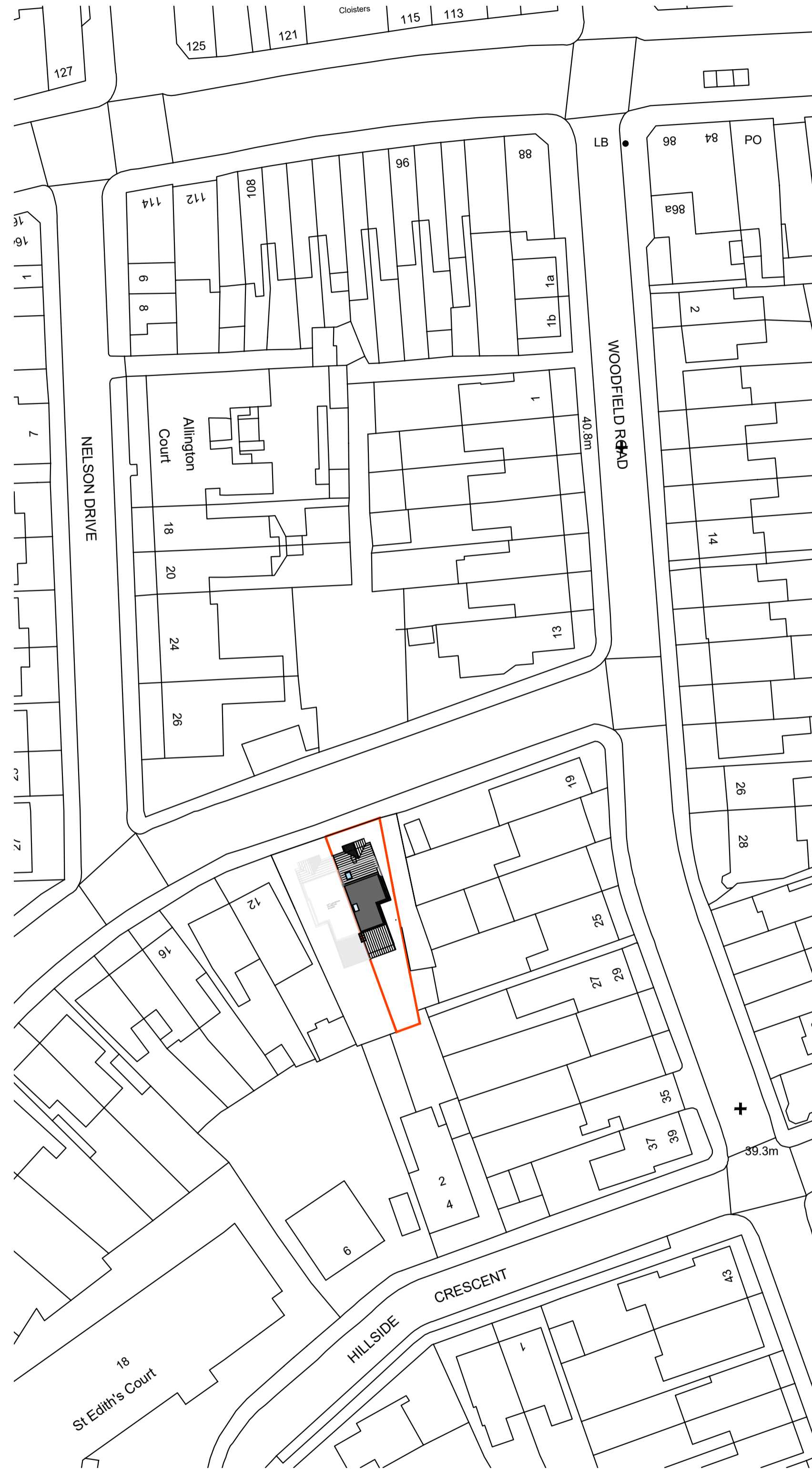
2 PROPOSED SITE BLOCK PLAN SCALE: 1:500 @ A2