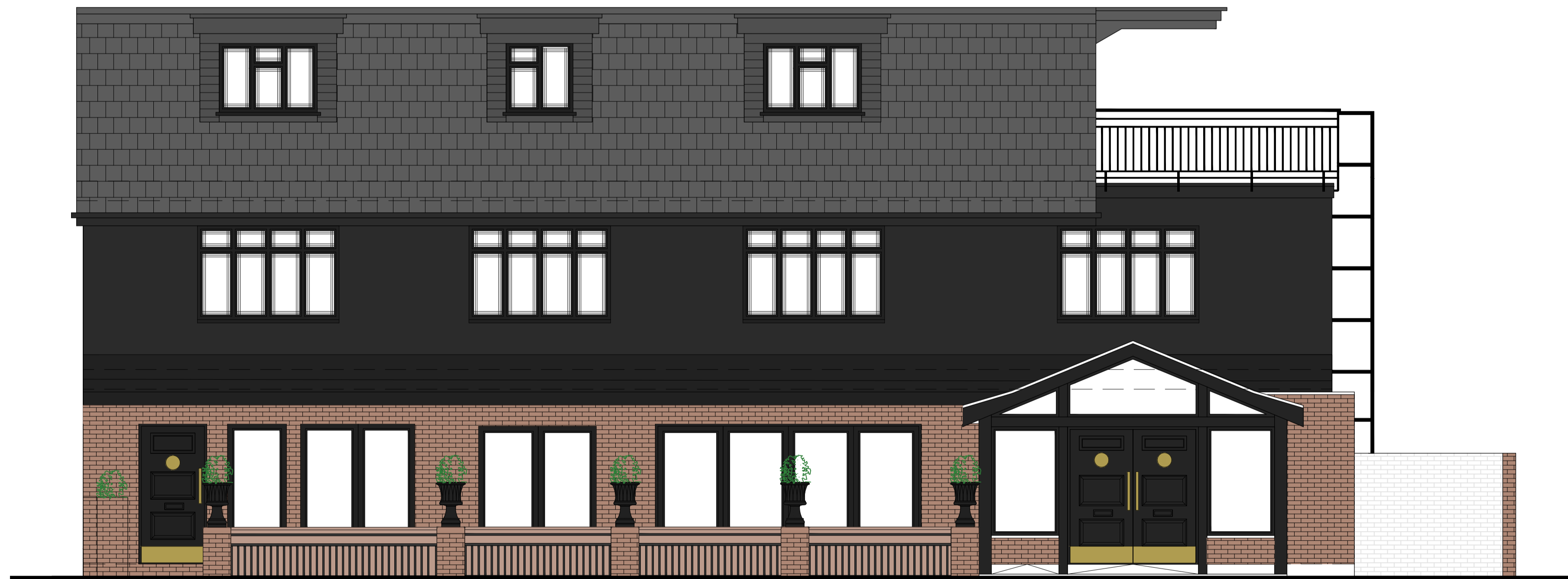
EXISTING FRONT ELEVATION Scale 1:50

The contractor is to check and verify all building and site dimensions, levels, and sewer invert levels at connection points before work starts. This drawing must be read with and checked against any structural or other specialist drawings provided. Any discrepancies found on this drawing are to be notified to STONE MEI DESIGN LTD prior to commencement of work. The contractor is to comply in all respects with the current Building Regulations whether or not specifically stated on these drawings. This drawing is not intended to show details of foundations or ground conditions. Each area of ground relied upon to support the structure depicted must be investigated by the contractor and suitable methods of foundations provided. This drawing is to be read in conjunction with all other standard STONE MEI DESIGN LTD specifications and documentation. STONE MEI DESIGN LTD reserves the right to withdraw any drawings from any applications or third parties should disputes arise between the client and STONE MEI DESIGN LTD. This drawing remains the copyright of STONE MEI DESIGN LTD and cannot be reproduced without prior permission.