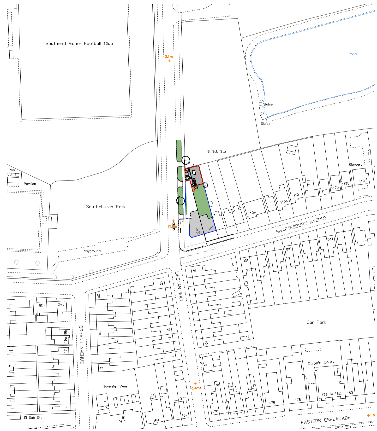
1 Location Plan