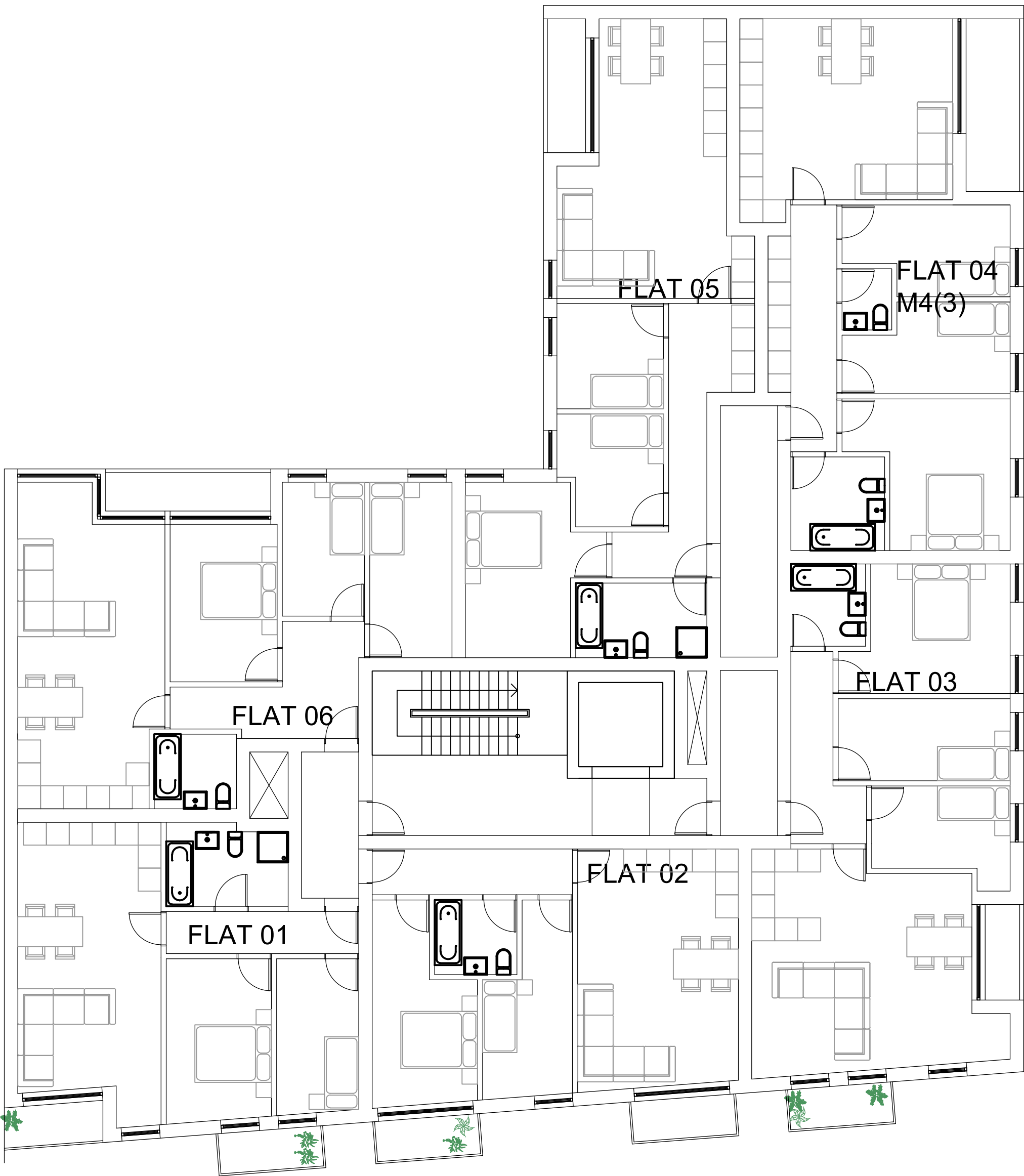
Proposed First Floor Plan 1:100