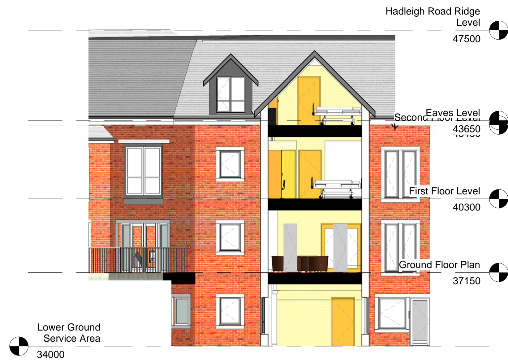
1 Proposed Basement Elevation 1 1 : 100