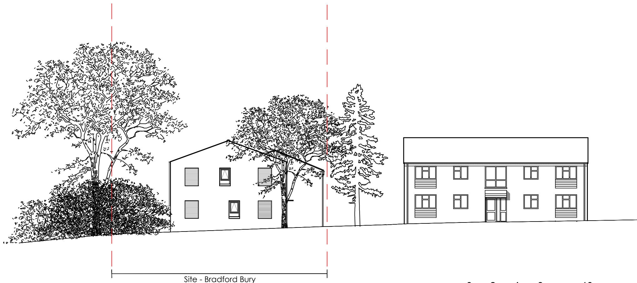
Street Elevation - West