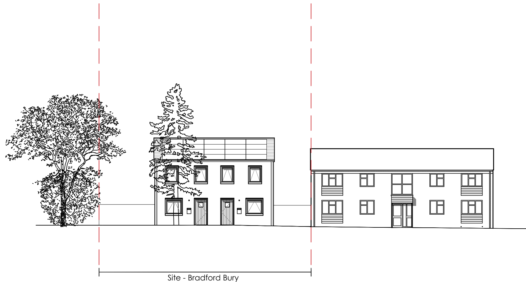
Street Elevation - South